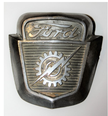
Most Unusual Old Ford Grill Badge Eric Figueroa